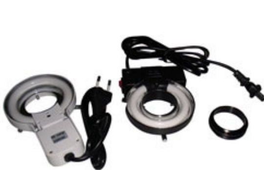
Ring fluorescent light