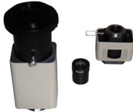
Video & Photo Attachment